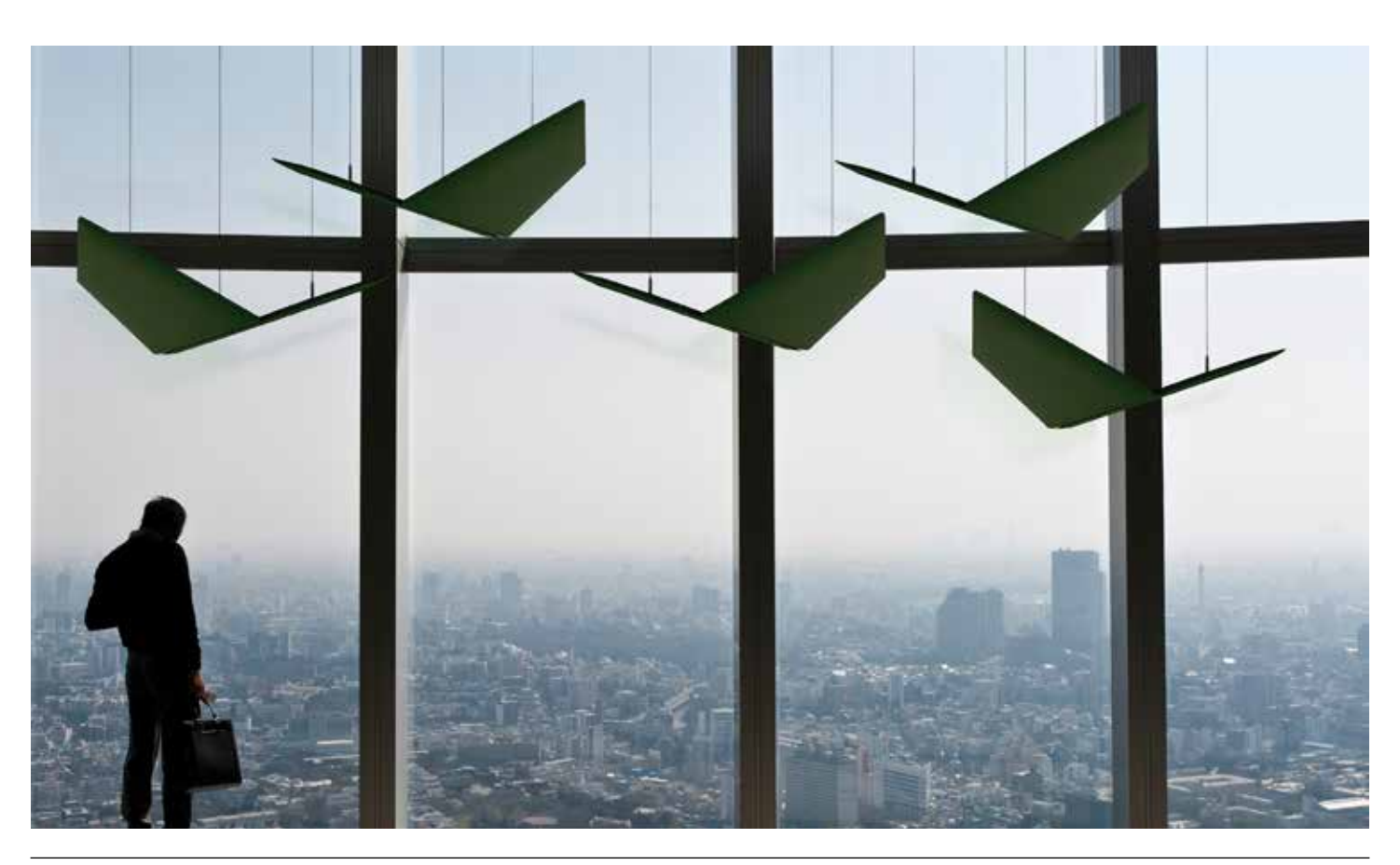
Caimi Brevetti S.p.A. reserves, by its unappealable judgment, the right to modify without prior notice the building materials, the technical and aesthetic specifications, as well as the dimensions of the products in this technical sheet, where pictures are purely as an indication.