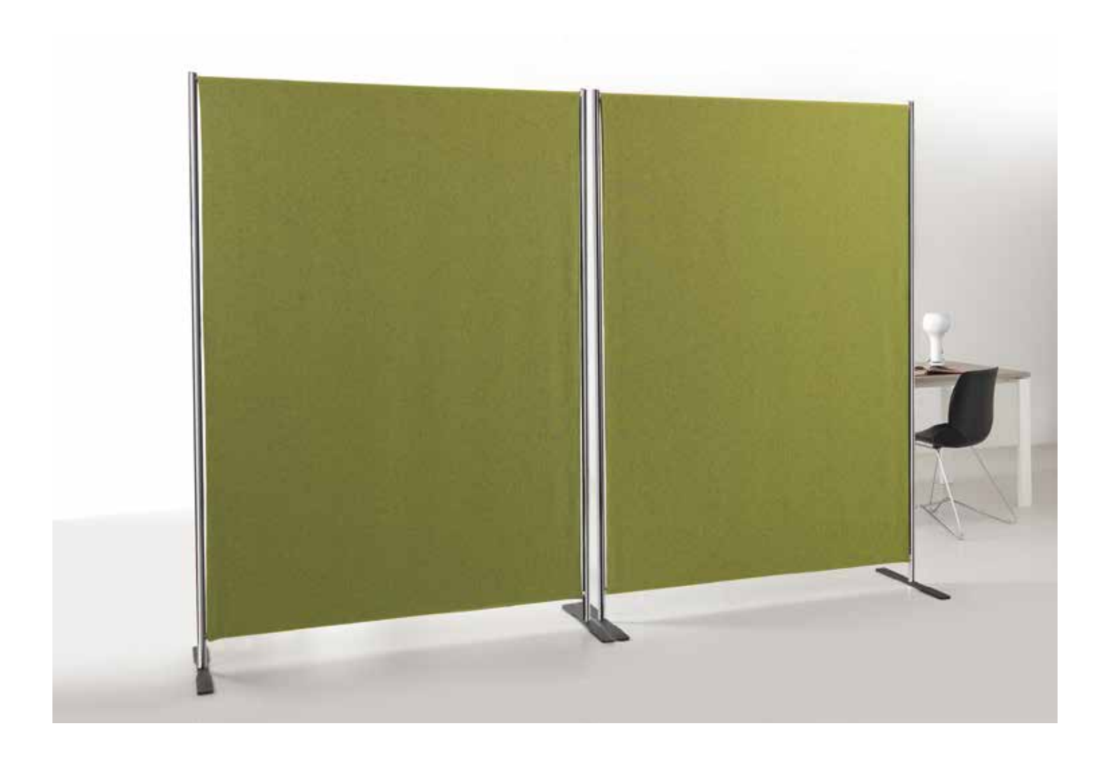
Caimi Brevetti S.p.A. reserves, by its unappealable judgment, the right to modify without prior notice the building materials, the technical and aesthetic specifications, as well as the dimensions of the products in this technical sheet, where pictures are purely as an indication.