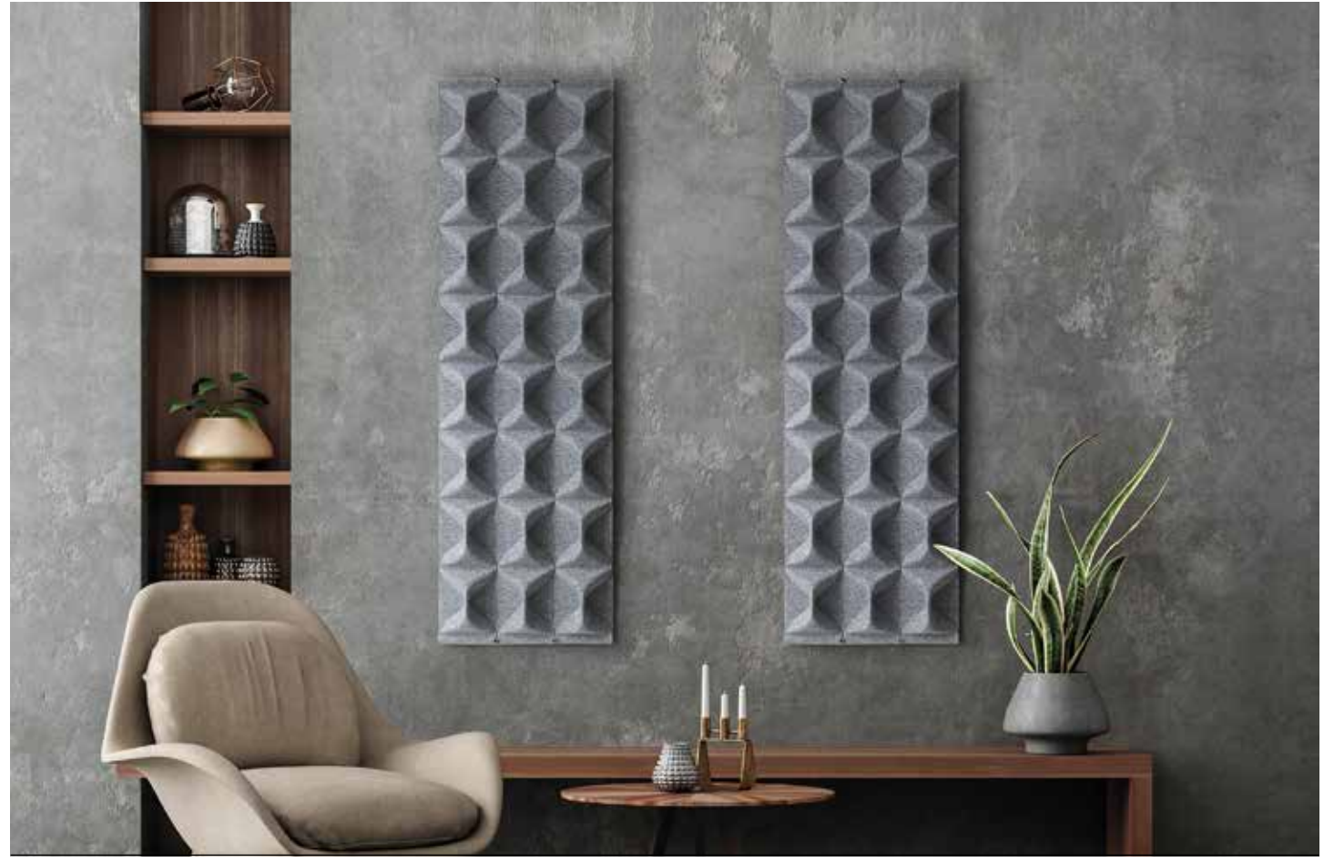
Caimi Brevetti S.p.A. reserves, by its unappealable judgment, the right to modify without prior notice the building materials, the technical and aesthetic specifications, as well as the dimensions of the products in this technical sheet, where pictures are purely as an indication.