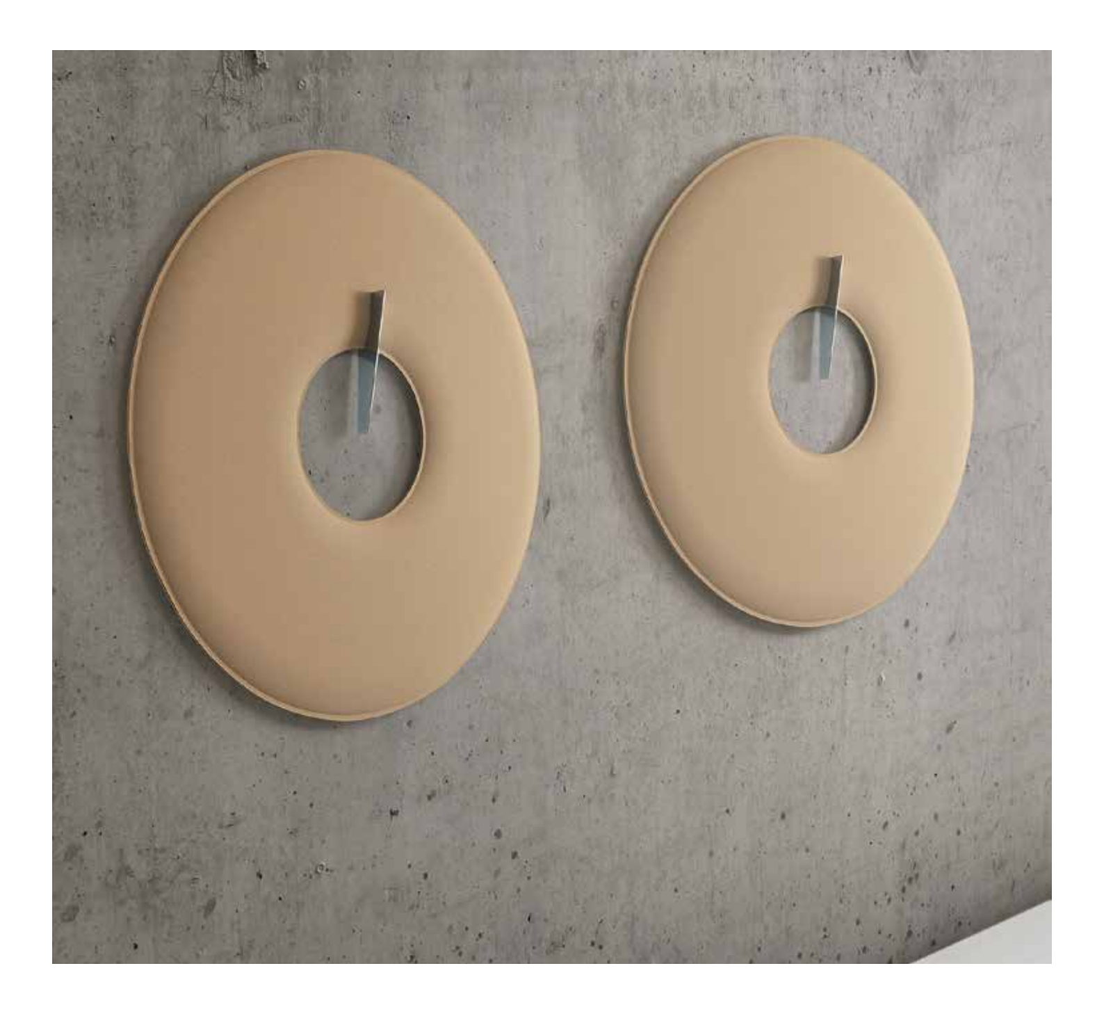
Caimi Brevetti S.p.A. reserves, by its unappealable judgment, the right to modify without prior notice the building materials, the technical and aesthetic specifications, as well as the dimensions of the products in this technical sheet, where pictures are purely as an indication.