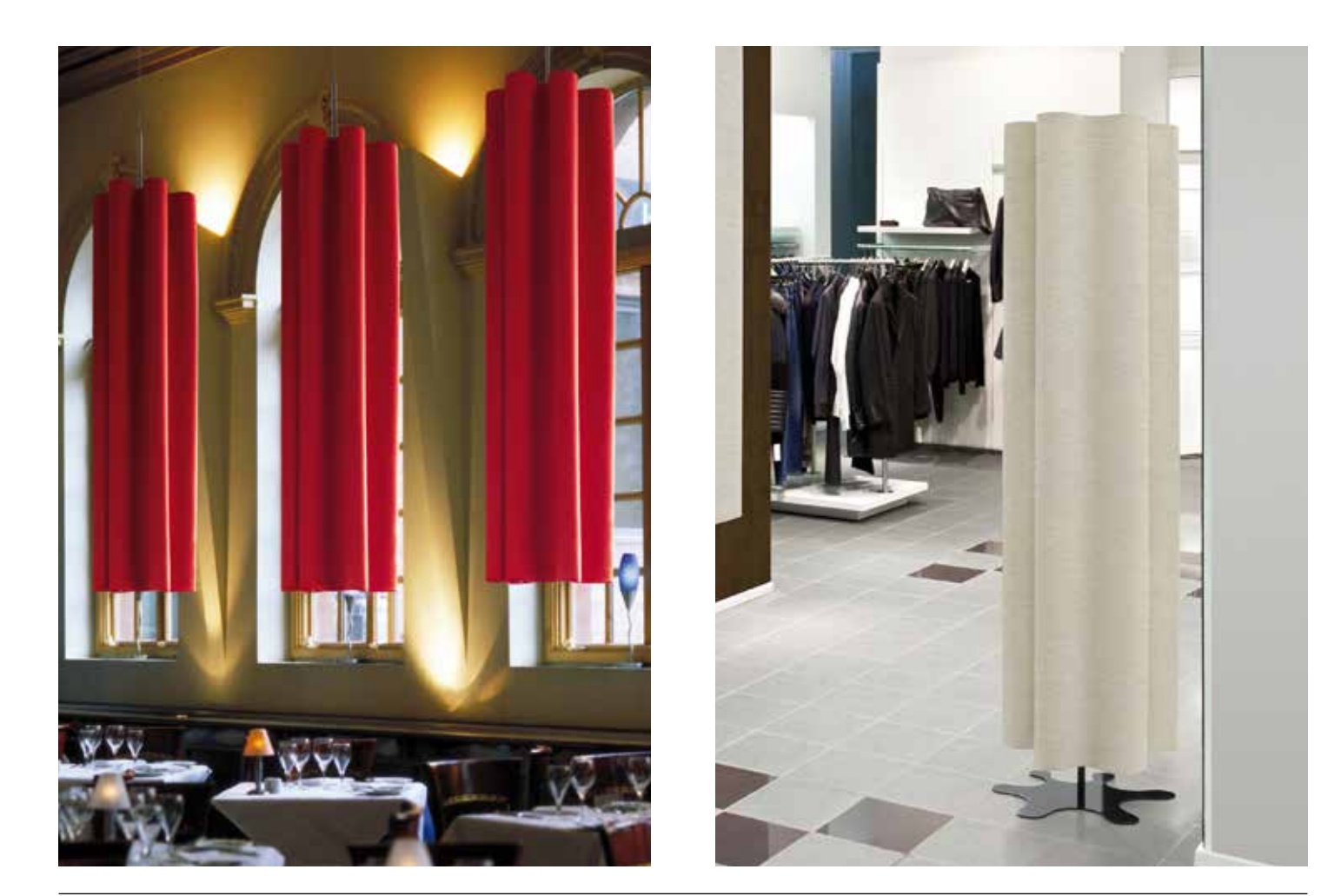
Caimi Brevetti S.p.A. reserves, by its unappealable judgment, the right to modify without prior notice the building materials, the technical and aesthetic specifications, as well as the dimensions of the products in this technical sheet, where pictures are purely as an indication.