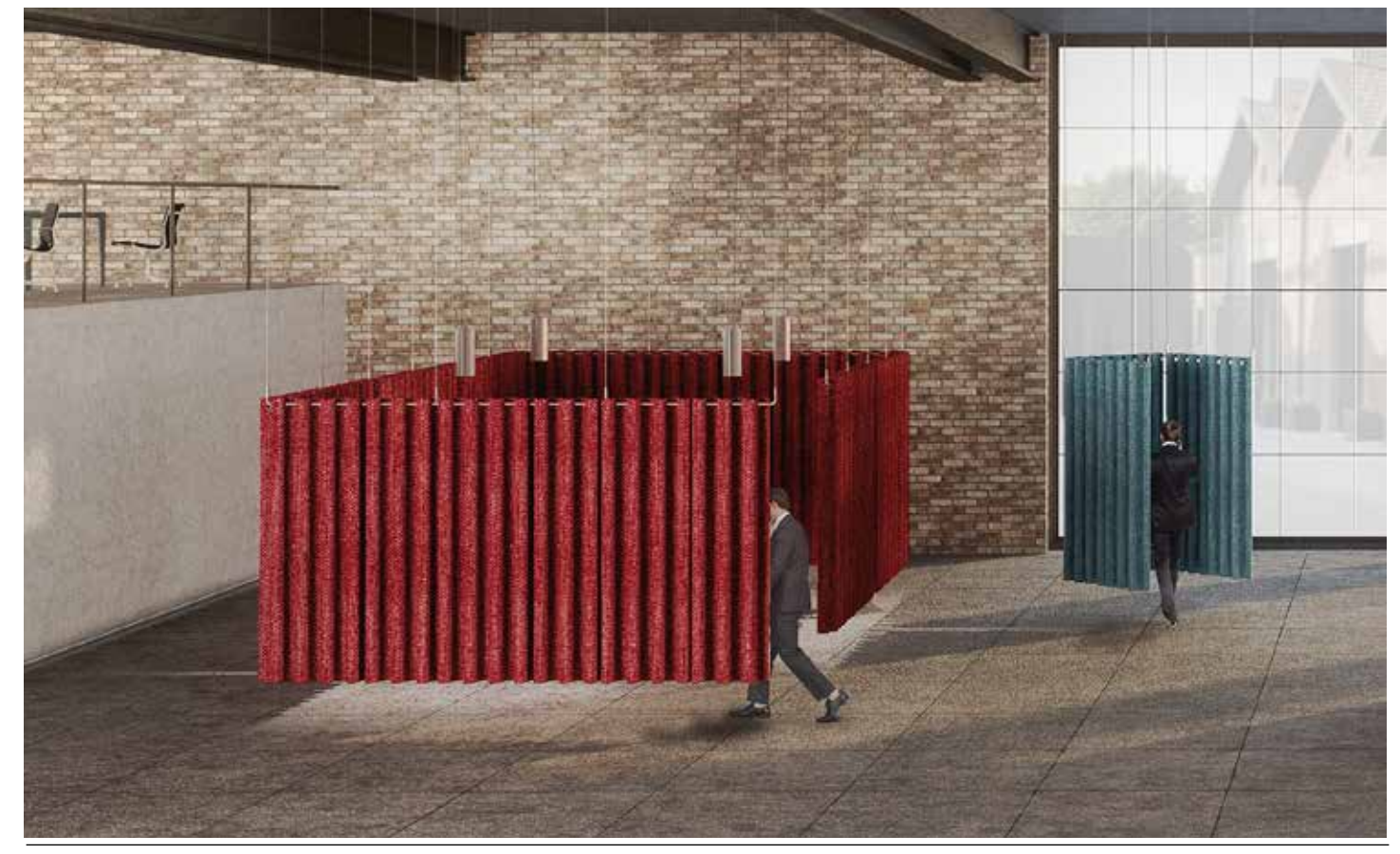
Caimi Brevetti S.p.A. reserves, by its unappealable judgment, the right to modify without prior notice the building materials, the technical and aesthetic specifications, as well as the dimensions of the products in this technical sheet, where pictures are purely as an indication.