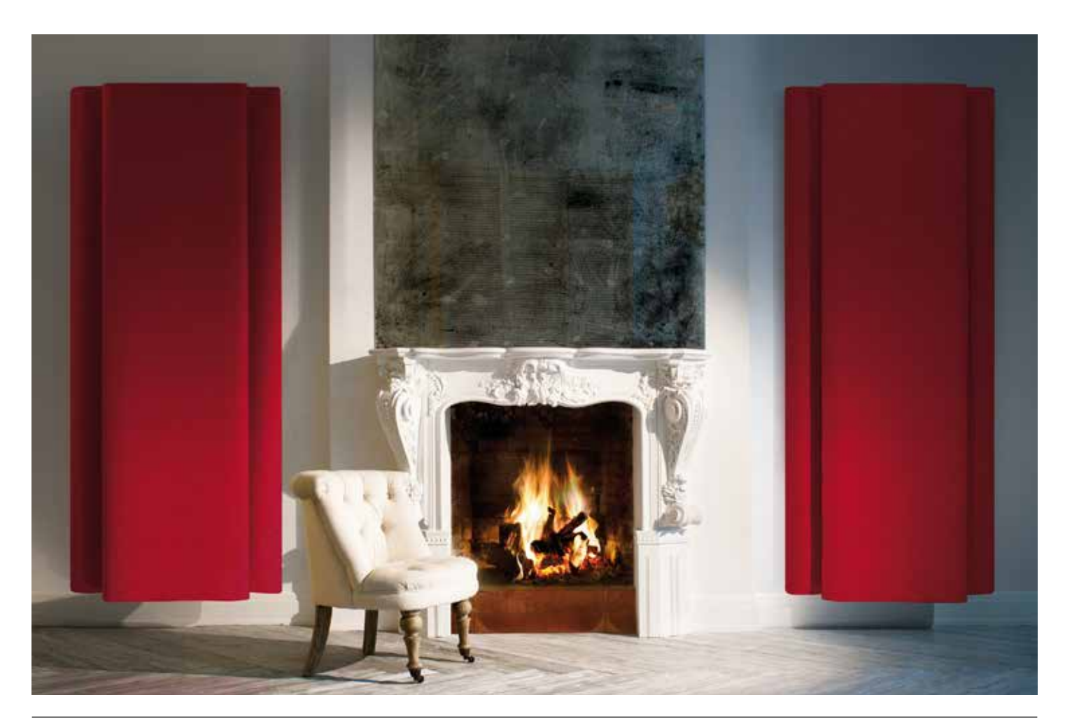
Caimi Brevetti S.p.A. reserves, by its unappealable judgment, the right to modify without prior notice the building materials, the technical and aesthetic specifications, as well as the dimensions of the products in this technical sheet, where pictures are purely as an indication.