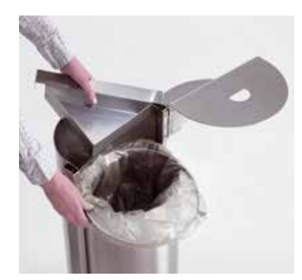
Detail of the liner holder