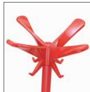
1486-AR Glossy orange red (RAL 2002)