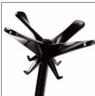
1486-N Glossy black