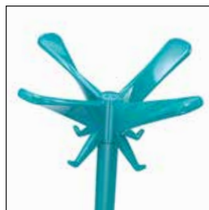
1486-OT Glossy water blue (RAL 2002)