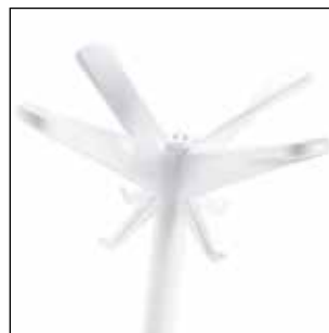
1486-B Glossy white