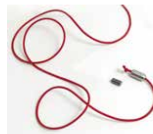
L. 200 cm