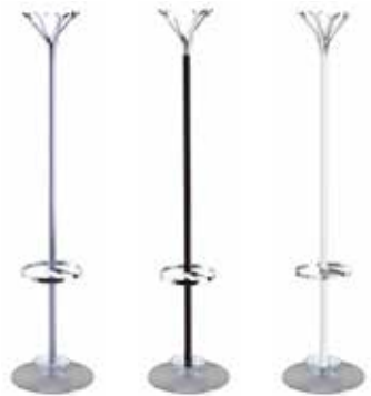
1696-I (GA) 1696-I (N) 1696-I (BO)

Description: free-standing circular shaped coat stand with a steel base (Ø 350 mm) covered in stainless steel equipped with a chromed zamak ring which locks the rod and floor-protecting feet. Textured black, silver grey or mat white epoxy-powder coated 32 mm diameter tubular steel stand, fastened to the base via M8 zinc-plated steel screws. Polished die-cast aluminium head comprising 4 modular arms held together by a high-tech polymer bushing. Polished aluminium umbrella stand ring assembled between the two uprights and fastened in place by M8 zinc-plated steel stud bolts. Translucent polycarbonate drip-tray.