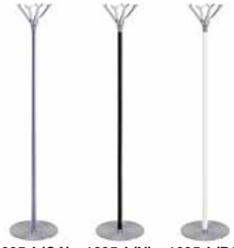
1695-I (GA) 1695-I (N) 1695-I (BO)